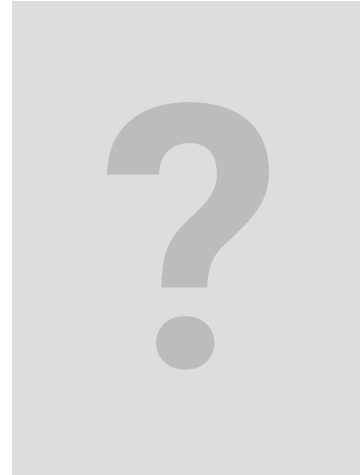
Special Guest Lecturers